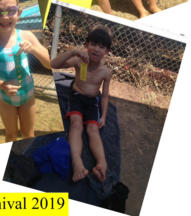
Swim Carnival 2019